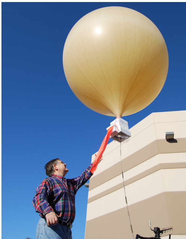
Bringing Remote Health Monitoring to Remote Areas – A Space Data Corporation hydrogen balloon, outfitted with a reflex transceiver, is released into the air above Arizona’s Navajo reservations to collect health data transmitted from MedApps’ HealthPAL Mobile Health Monitoring Device.

The bottom line is that m-Health solutions are not an added “burden” in cost to the existing healthcare system. But should be seen as a means to realign current expenditures and incentives / reimbursement in order to maximize the greatest ROI from the existing system.