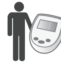
Reading with IDEAL LIFE Manager